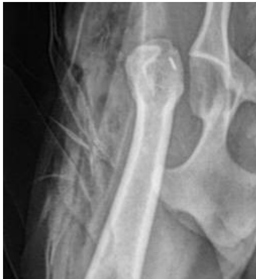
femoral head cut off after FHNO

Ultimately, the goal of the femoral head and neck osteotomy (FHNO) surgery is to create a false hip joint that will be more comfortable and yield better mobility than the diseased joint the patient had before. Since results are generally so good with surgery, provided the patient is relatively small and/or relatively active, often simply removing the femoral head is the least invasive, least costly, and fastest route to a pain-free mobile hip.