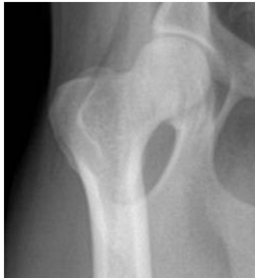
normal hip (radiograph courtesy Mar Vista Vet)